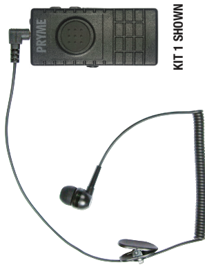
KIT 1 SHOWN

For use with Android and Apple iOS smartphones using the AT&T EPTT app.