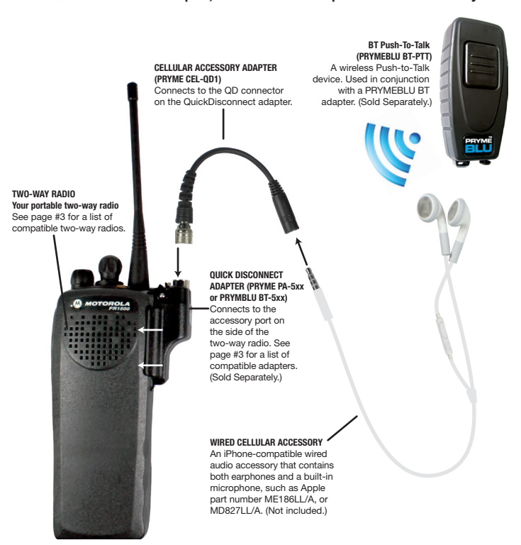
NOTE: Always power your two-way radio off when connecting or disconnecting any adapters or wired audio accessories.

This diagram shows how to connect your two-way radio, PRYME QuickDisconnect adapter, and wired cellular phone audio accessory.