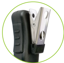
Metal Reinforced Swivel Clip