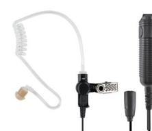
SPM-3305 HEAVY DUTY 3-WIRE SURVEILLANCE KIT