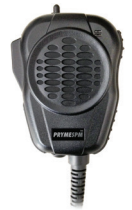
SPM-4205 Storm Trooper® HEAVY DUTY SPEAKER MIC