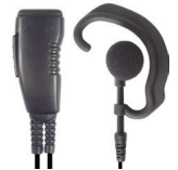
SPM-305EB Responder™ MEDIUM DUTY LAPEL MIC