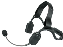
NBP-BH05 TACTICAL BONE CONDUCTION HEADSET