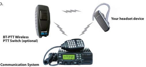
FIG. 4 - Wireless Communication System