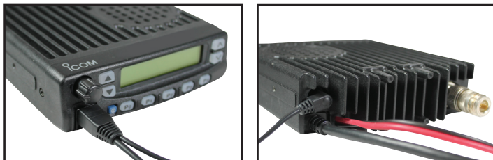
FIG. 3 Typical Front and Rear Connection Radio