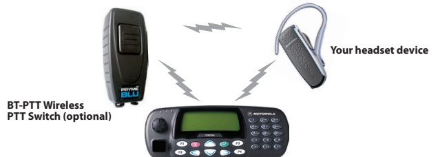
FIG. 4 - Wireless Communication System