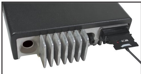
FIG. 2 Typical Rear Connection Type Radio