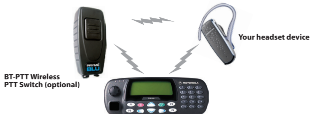
FIG. 4 - Wireless Communication System