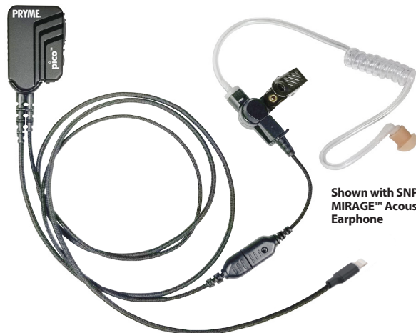
Shown with SNP-AT MIRAGE™ Acoustic Tube Earphone

The PICO is a revolutionary wired microphone kit with a removable earphone, for use with Apple iPhones with Lightning connectors, running many different Push-to-Talk over Cellular (PoC) apps.