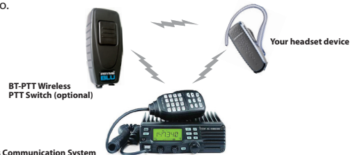
FIG. 4 - Wireless Communication System