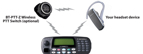
FIG. 4 - Wireless Communication System