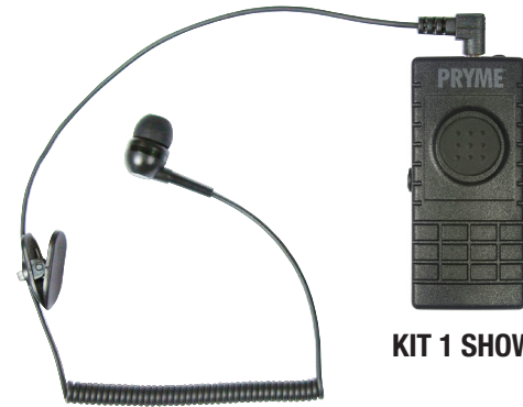
KIT 1 SHOWN

The BTH-300-HY is a wireless lapel microphone kit designed for use with HYTERA BT enabled two-way radios.