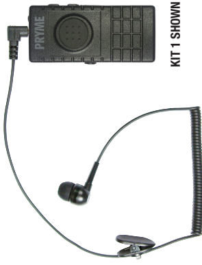
KIT 1 SHOWN

For use with Android and Apple iOS smartphones using the AT&T EPTT app.