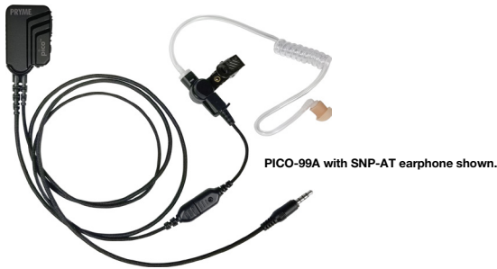
PICO-99A with SNP-AT earphone shown.

Optional audio accessory for use with the PRYME Dual Adapter