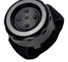
BTT-PTT-A (mini) included in WTX Kits

Wireless PTT Adapter Series Number: WTX Made in Taiwan