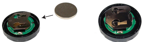
Wireless Finger PTT is included in all WTX Kits (also available separately)