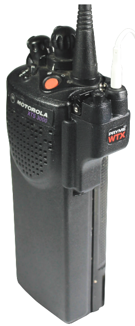
Apple ® compatible ONLY

Headset button DOES NOT ACTIVATE PTT. (mutes microphone when pressed)