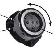
Rotate Housing to Access Battery

The plastic housing of the finger PTT can be separated by rotating the front and rear halves of the housing in opposite directions. Doing so will expose the battery holder.