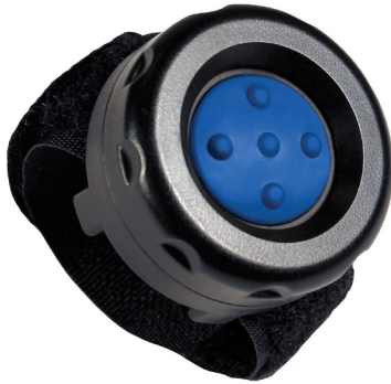
Model No. BT-PTT-U Made in Taiwan

Note: Does NOT work With WaveCommunicator.