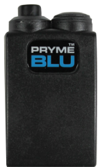
BT Adapter Model No.: BT-501-DIRECT Made in Taiwan

The PRYMEBLU Adapter allows you to use a compatible wireless headset or other audio accessory with your 2-way radio.