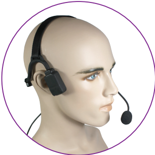
Ears open for situational awareness