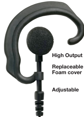
High Output Speaker