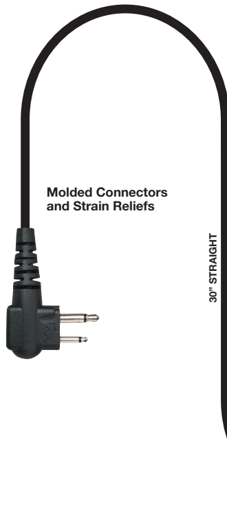
Molded Connectors and Strain Reliefs