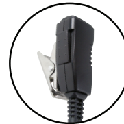
PTT and Microphone have Stainless Steel Clip