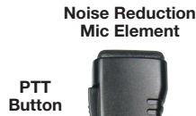
Noise Reduction Mic Element