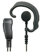
SPM-305EB Responder ™ Medium Duty Lapel Mic