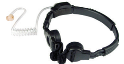
SPM-1505 Gladiator ™ Dual Element Throat Mic