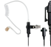
SPM-3305 Heavy Duty 3-Wire Surveillance Kit