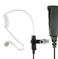
SPM-2305 Medium Duty 2-Wire Lapel Mic