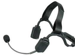
NBP-BH05 Tactical Bone Conduction Headset