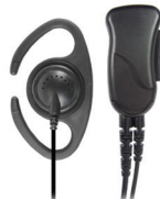
SPM-1205C Defender ™ Medium Duty C-RING Lapel Mic