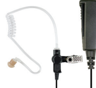
SPM-2305 Medium Duty 2-Wire Lapel Mic