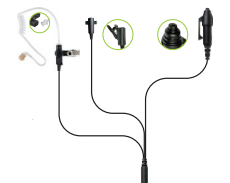
SPM-3305 Heavy Duty 3-Wire Surveillance Kit