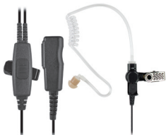
SPM-2005 2-WIRE Clear Tube Surveillance Kit