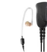
SPM-3005 Medium Duty Lapel Mic w/Bullet Transducer