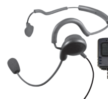
SPM-1405 Patriot ™ Lightweight Boom Mic Headset