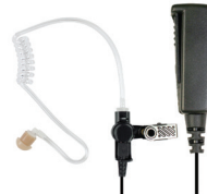
SPM-2305 Medium Duty 2-Wire Lapel Mic