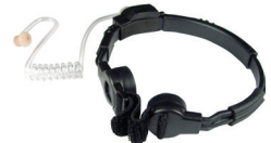
SPM-1505 Gladiator ™ Dual Element Throat Mic