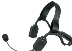
NBP-BH05 Tactical Bone Conduction Headset