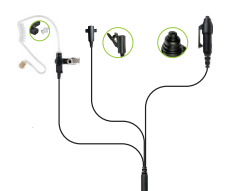
SPM-3305 Heavy Duty 3-Wire Surveillance Kit