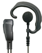
SPM-305EB Responder ™ Medium Duty Lapel Mic