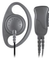
SPM-1205 Defender ™ Medium Duty D-RING Lapel Mic