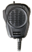
SPM-4205 Storm Trooper ® Heavy Duty Speaker Mic