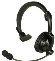
HLP-SNL Padded Boom Headset

The PRYME Quick Disconnect feature is available for these products: