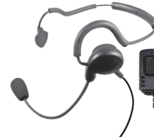
SPM-1405 Patriot ™ Lightweight Boom Mic Headset