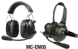
MC-EM05 Cable for HBB-EM and HDS-EM Dual Muff Headsets