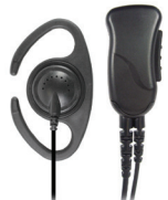
SPM-1205C Defender ™ Medium Duty C-RING Lapel Mic