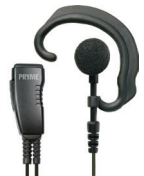
SPM-305EB Responder ™ Medium Duty Lapel Mic