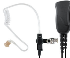
SPM-1305 Mirage ™ Medium Duty Lapel Mic