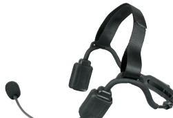
NBP-BH05 Tactical Bone Conduction Headset