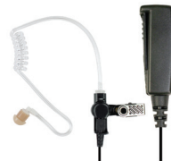
SPM-2305 Medium Duty 2-Wire Lapel Mic