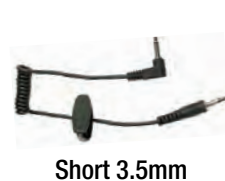
Short 3.5mm cable included (fits all PRYME Speaker Mics)