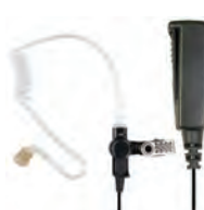
SPM-2305 MEDIUM DUTY 2-WIRE LAPEL MIC