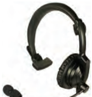
HLP-SNL PADDED BOOM HEADSET

The PRYME Quick Disconnect feature is available for these products: