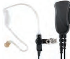
SPM-1305 Mirage™ MEDIUM DUTY LAPEL MIC