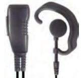
SPM-305EB Responder™ MEDIUM DUTY LAPEL MIC