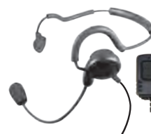
SPM-1405 Patriot™ LIGHTWEIGHT BOOM MIC HEADSET