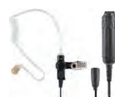
SPM-3305 HEAVY DUTY 3-WIRE SURVEILLANCE KIT