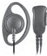
SPM-1205 Defender™ MEDIUM DUTY D-RING LAPEL MIC