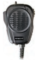
SPM-4205 Storm Trooper® HEAVY DUTY SPEAKER MIC