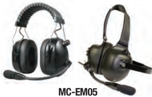
MC-EM05 CABLE FOR HBB-EM and HDS-EM DUAL MUFF HEADSET