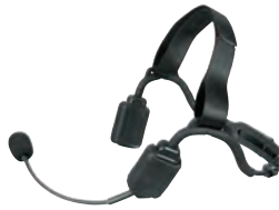
NBP-BH05 TACTICAL BONE CONDUCTION HEADSET