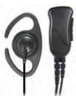
SPM-1205C Defender™ MEDIUM DUTY C-RING LAPEL MIC