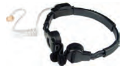
SPM-1505 Gladiator™ DUAL ELEMENT THROAT MIC