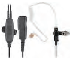
SPM-2005 2-WIRE CLEAR TUBE SURVEILLANCE KIT