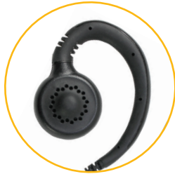
High Output Speaker