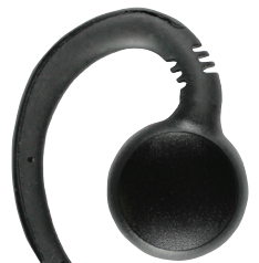
Swivel rotates for either ear