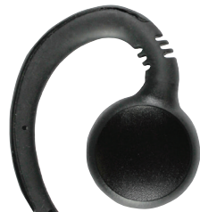
Swivel rotates for either ear