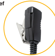
Metal Reinforced Swivel Clip