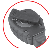
Metal Reinforced Swivel Clip

Changing radio models? Just buy a new cable. (pg. 48) Need a replacement mic or speaker? (pgs. 45-46)