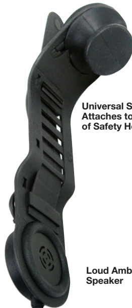
Noise Resistant Skull Microphone