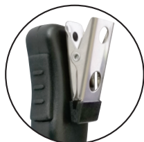
Metal Reinforced Swivel Clip