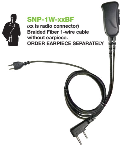
SNP-1W-xxBF (xx is radio connector) Braided Fiber 1-wire cable without earpiece. ORDER EARPIECE SEPARATELY