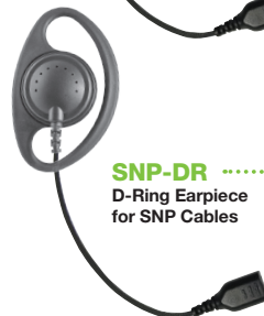
SNP-DR D-Ring Earpiece for SNP Cables