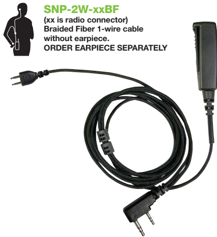
SNP-2W-xxBF (xx is radio connector) Braided Fiber 1-wire cable without earpiece. ORDER EARPIECE SEPARATELY