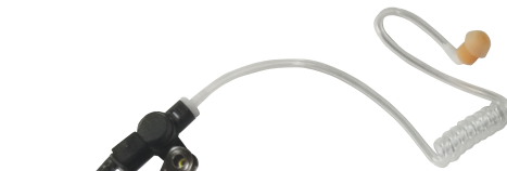
SNP-AT Acoustic Tube Earpiece for SNP Cables