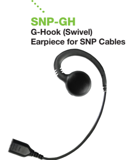
SNP-GH G-Hook (Swivel) Earpiece for SNP Cables