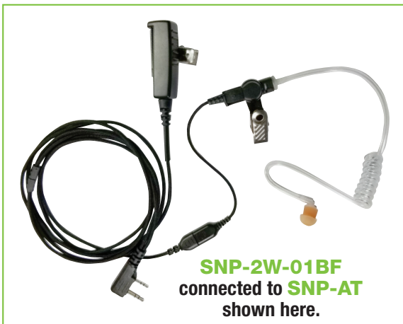
SNP-2W-01BF connected to SNP-AT shown here.