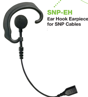
SNP-EH Ear Hook Earpiece for SNP Cables