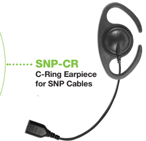
SNP-CR C-Ring Earpiece for SNP Cables