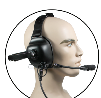
Replaceable Radio Interface Cable sold separately - page 50