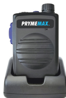
Optional Cradle Charger Part No. P-CHA-DT1