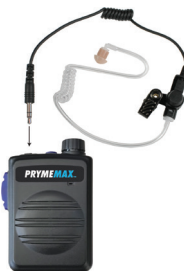
EH-1389XC model shown. Earphone sold separately.